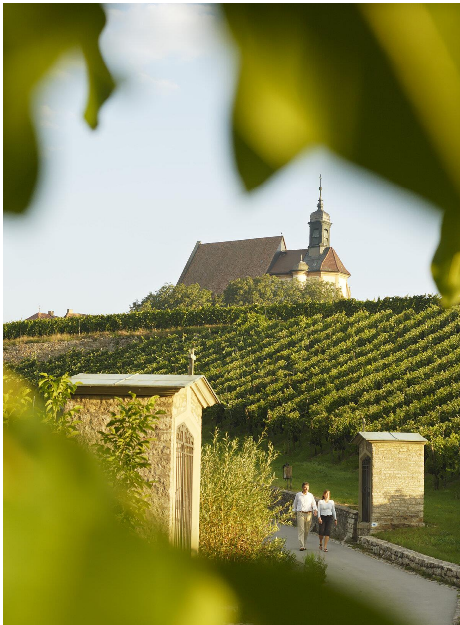
The pilgrimage church "Maria im Weingarten"