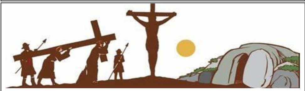
Stations of the Cross - Hassop - 11:30am - Each Wednesday before Mass

CAFOD Syria-Turkey Earthquake Appeal CAFOD - is responding with support of provision of food, water, shelter, medical assistance and winter kits for survivors. Let us join CAFOD in praying for our sisters and brothers affected by the earthquakes and the winter weather. Your support for CAFOD throughout the year allows our Catholic agency to act quickly when disasters strike, but more help is needed. For more details visit CAFOD's Syria Turkey Emergency Appeal online at https://cafod.org.uk/give